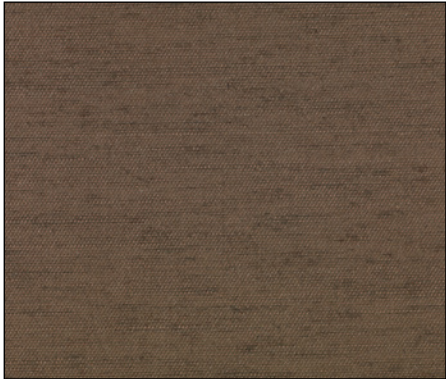
EARTH BROWN finish available in stock*