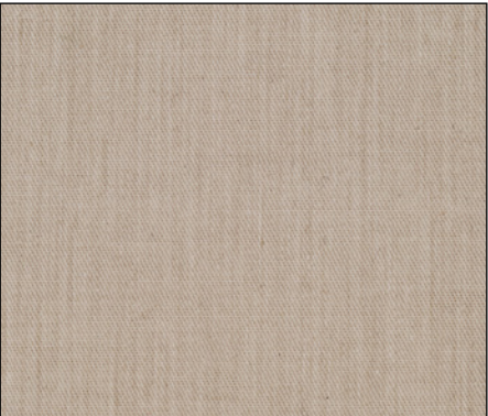
SAND finish on request