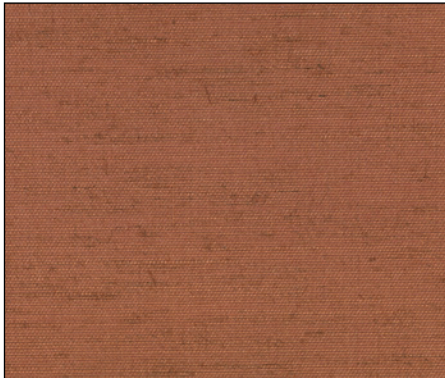
PEARLESCENT BRICK finish on request