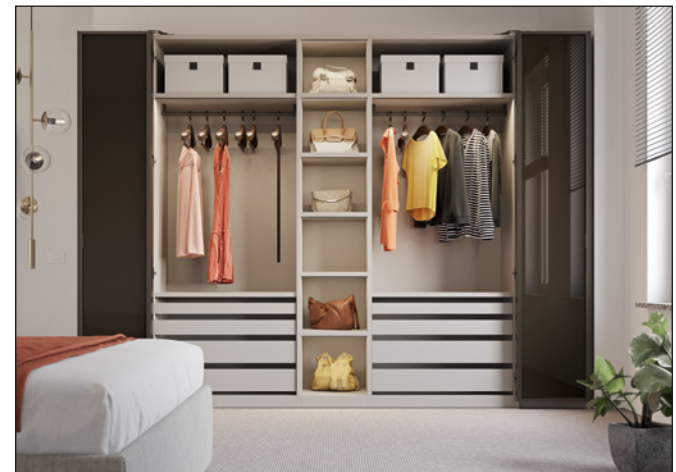
• Folder 180 - Conventional cabinet - bedroom •