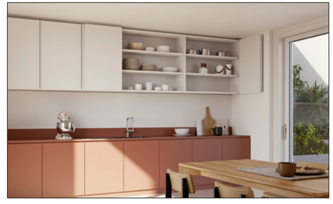
• Folder 90 e 180 - Kitchen wall units •

Folder can create a transition between rooms with effortless style, as well as suitable to be used on bathroom cabinets creating easy access.