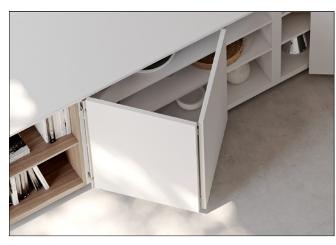
• Folder 180 - Assisted opening and closing •

Similarly, closing involves the use of a hand to bring the door up to mid-way, leaving the spring system to complete the closing process, cushioned by the damper.