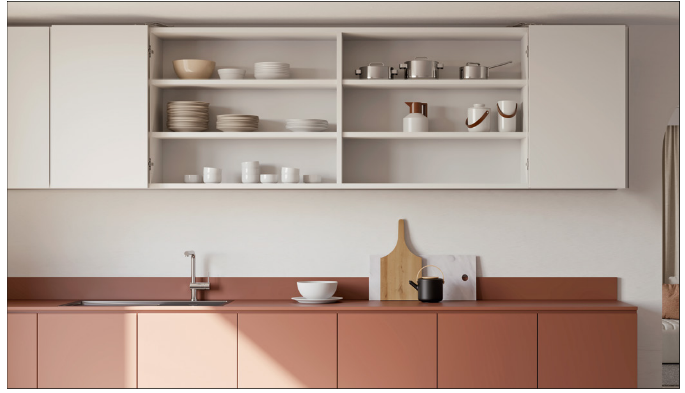
• Folder 180 - Recessed •