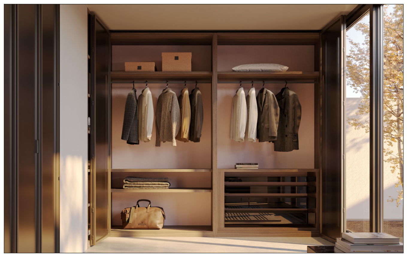
• Folder 90 - Recessed •

Versatile and suitable for any room, with a system height of 35 mm, Folder is the ideal solution to apply to any type of furniture.