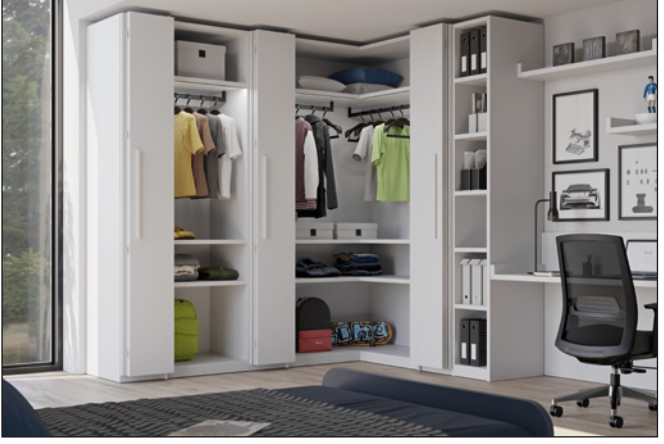
• Folder 180 - Corner cabinet - Unrestricted access to the cabinet •

accessibility to all areas of cabinet with no restrictions.