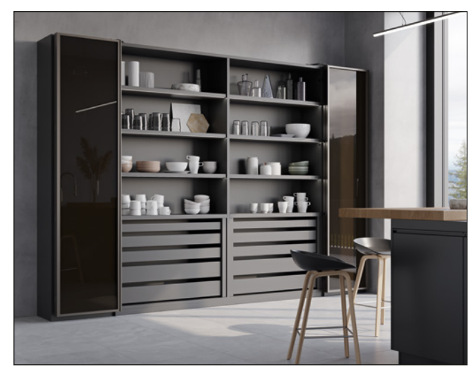
• Folder 180 - Unrestricted access to the cabinet •

The 180° opening of Folder 180 , which allows full unrestricted access to the cabinet. The 90° opening version of Folder 90 is useful when there are walls or obstructions at the side of the cabinet, Folder offers a solution to any applications.