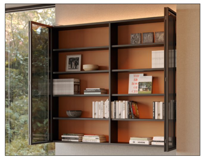
• Folder 90 - Wall alongside the cabinet •