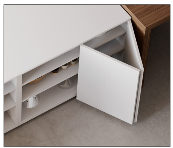
• Folder 90 - Manual opening, assisted close •

A magnetic system gently accompanies the doors to the closed position.