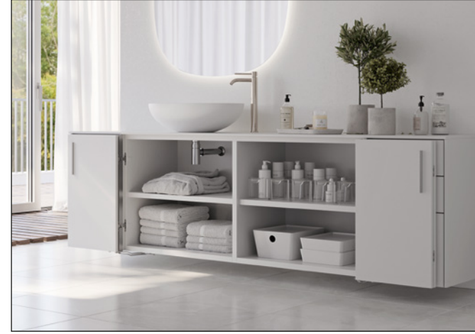
• Folder 180 - Bathroom cabinet •