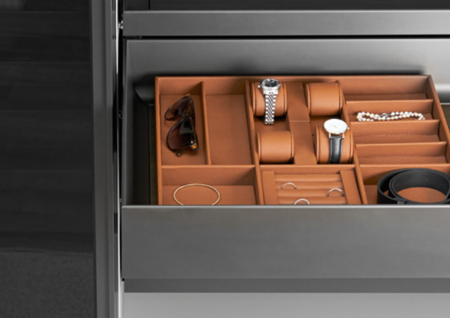
• Folder 180 - Internal drawers without the need of spacers •

• Folder 180 - Unrestricted access to the cabinet •