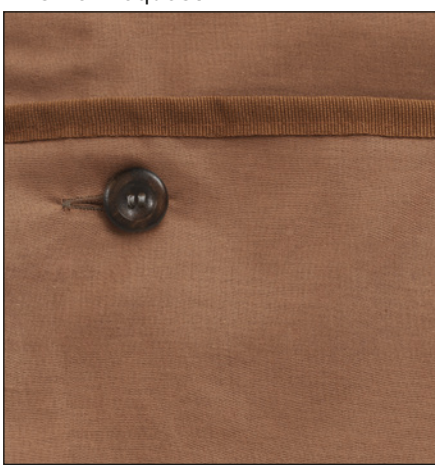
BRICK BROWN finish on request