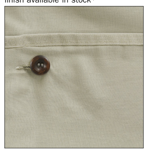
STONEWARE GREY finish available in stock*